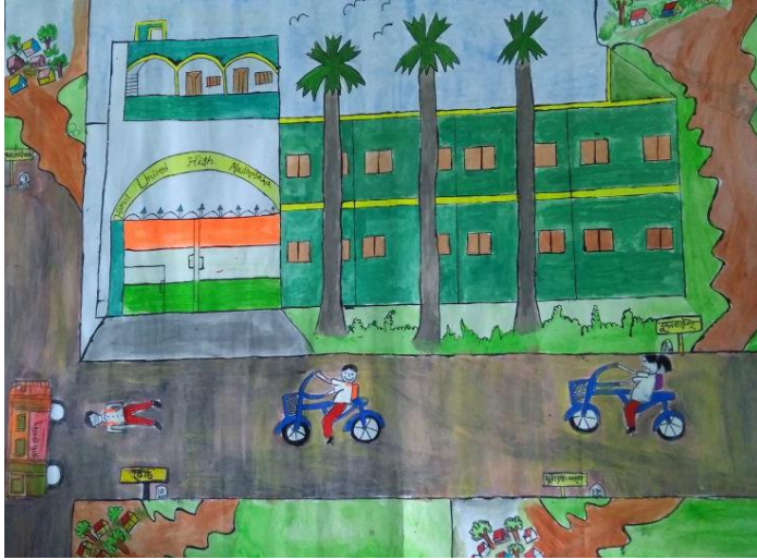
Picture 5 Students' imagination of SaboojSathi

In addition to facilitate the students accessing the schools, the bicycle is being used for various other purposes by the recipients as well as other members of their families – going to the market, transporting things, fetching water, attending ceremonies, going to cinema or local cultural functions, seeing a doctor, especially in emergency, and so on. But, one of the