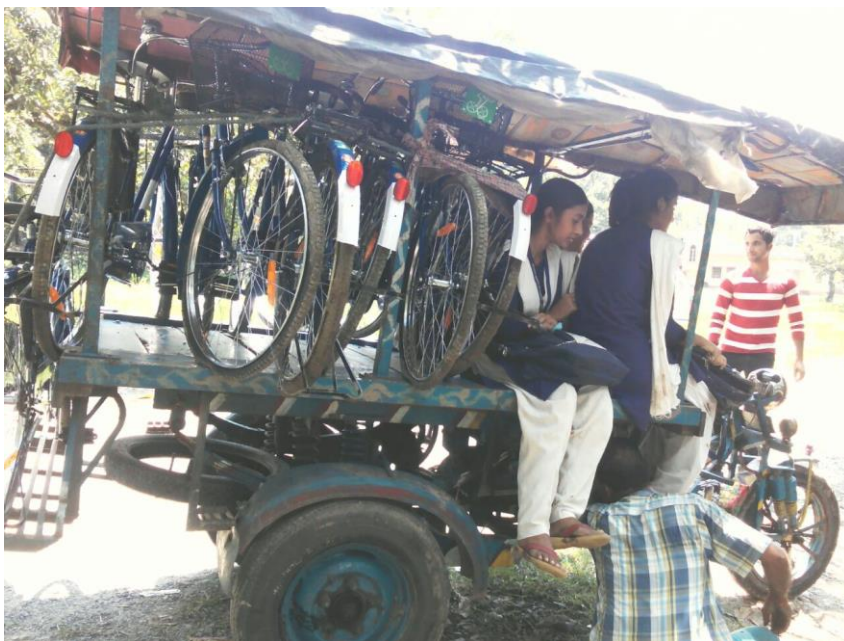
Picture 6 Student recipients carrying their bicycles on a motorised van to the local mechanics shop to get them ready to use

According to the modalities the suppliers are to transport the bicycles to the point of delivery in knocked down condition and make the fitting over there. Now, the fitters, hired by the suppliers, get their wage on per piece basis. According to a local mechanic, ‘an expert fitter can fit at best 3 bicycles a day, but the fitters hired by the supplier fit 6-7 cycles a day. How is it possible? Moreover, sometime they replace the original wires and tears with some cheaper versions.